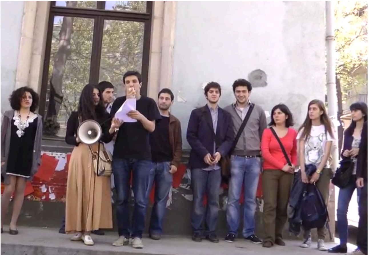
Figure 2. Some of the Laboratory 1918 activists reading the manifesto.

activists as “revolutionary secretaries (Sargent, 1981).” Since its inception, gendered patterns were infused in the activism of Laboratory 1918.