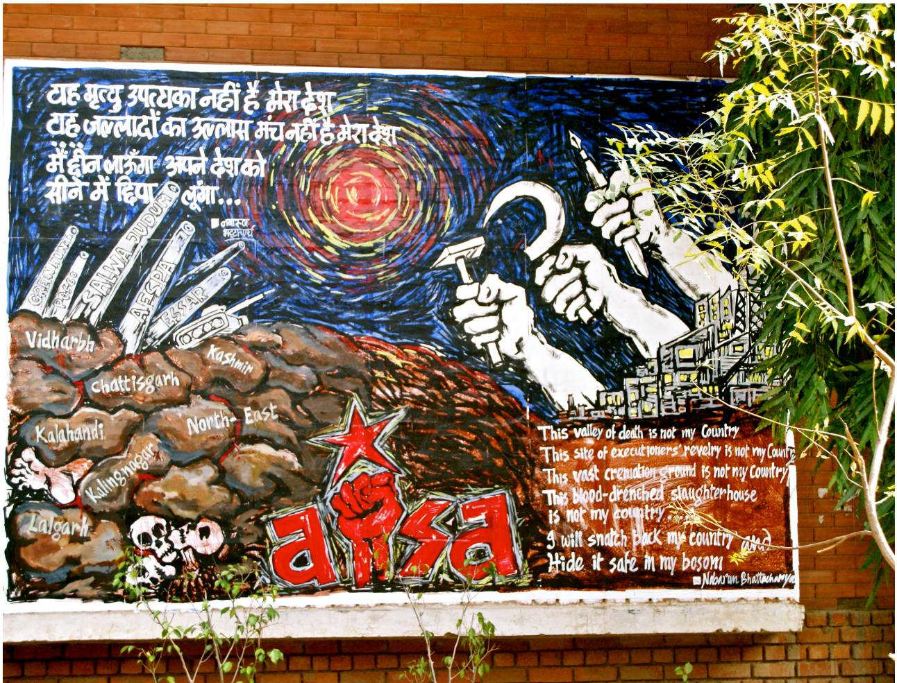
Figure 3: Wall painting at Jawaharlal Nehru University.

wall paintings criticize communists, Naxalites, and Marxists, exhorting “no glory for Marxists” and spurring students on to action: “When communism is the enemy, it is a crime not to fight.”