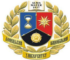
Donetsk National University