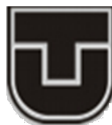
Economic Faculty of Technical University (Koshice, Slovakia)