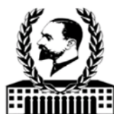
Business Academy of D.A. Tsenov (Svyshtov, Bulgaria)