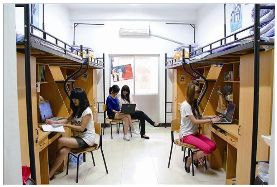
Remark: Double rooms have the same space but only two beds in.