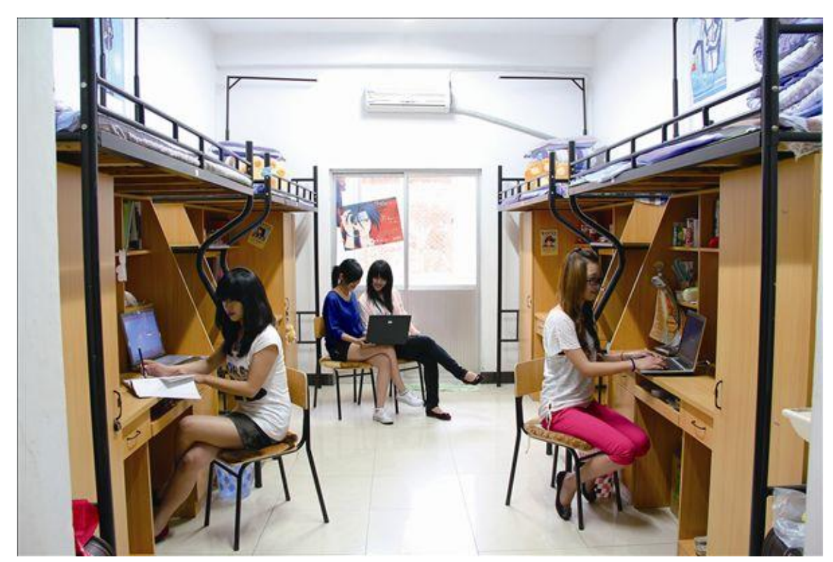
Remark: Double rooms have the same space but only two beds in.